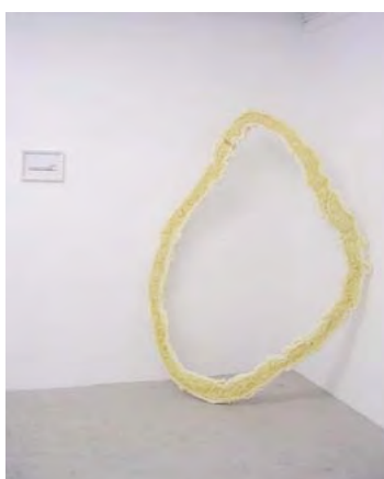
Laura Green, 001 (Untitled: 001), mixed media, 2007

Through looking at objects I explore notions of memory, solitude, dream, reverie, loss and the yearning for another time. Something unquantifiable about the forms I look at move and captivate me. I am concerned with the relationship between psychological and physical space.